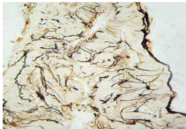
Figure 2. Small loop wale network of reticular fibers of the myocardium. Colour: